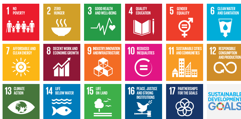
Figure 1: Sustainable Development Goals

The term 'lifelong learning (LLL) policy' is used to refer to any kind of policy designed and implemented by governments and other stakeholders to create learning opportunities for all ages (children, young people, adults and older people, girls and boys, women and men), in all life-wide contexts (family, school, community, workplace and so on) and through a variety of modalities (formal, non-formal and informal).