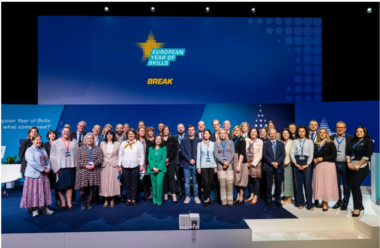
European Year of Skills National Coordinators

governance. The plan aims to facilitate easy access to training, also through the implementation of the Individual Learning Accounts initiative and micro-credentials, aided by the RRF for curriculum updates.